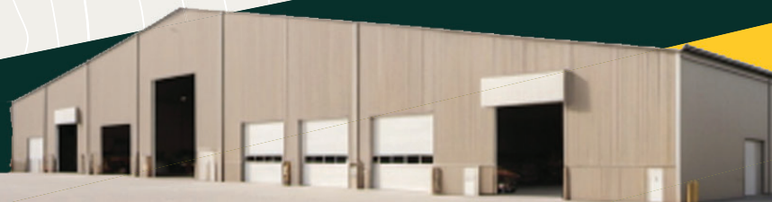
Illustrated Concept of an Expanded Trades Facility

Continued development towards a state-of-the-art trades training facility, further enhancing the ability to support a wide range of educational and training opportunities for students and employers.